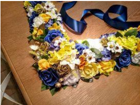
Penrose Park Garlands